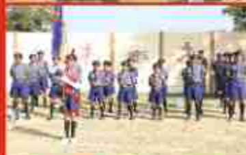
Scouting brings in discipline. Band brings in coordination.