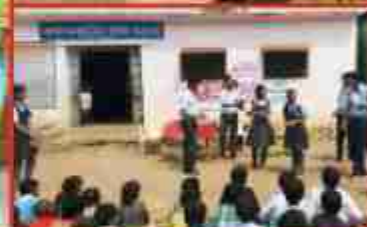
Visits to historical places and community services are a regular part of our curriculum.