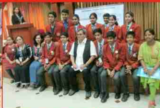
Gold Winning students of Red Rose School, Lambakheda, Bhopal with noted film maker Mr. Subhash Ghai at the National Youth Film Festival in Goa.